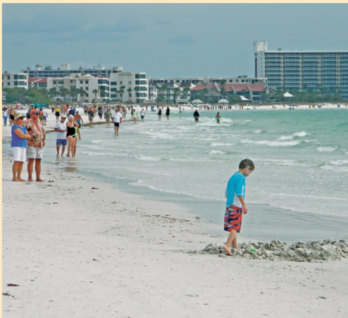
Coastal Florida is highly developed in many places. In this photo, residential and recreational uses coincide in Sarasota County.