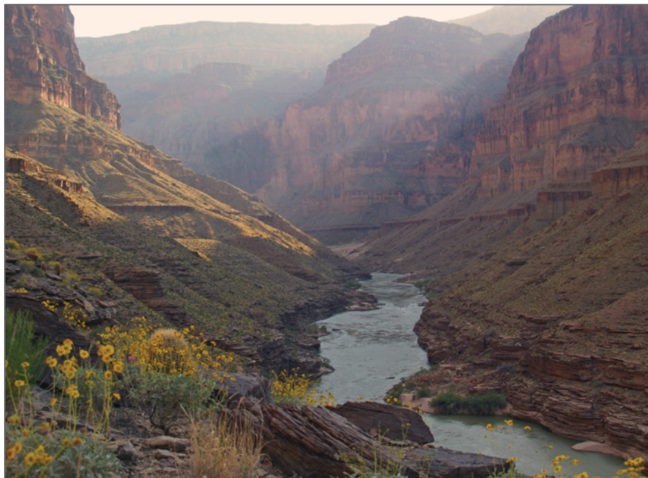
As one of the most carefully managed river systems in the world, the aquatic ecosystem of the Colorado River in the Grand Canyon has been heavily influenced by Glen Canyon Dam and the decades of controlled release of water for power generation.

Food is a resource that often limits the distribution or abundance of animal populations. In streams and rivers, aquatic invertebrates are an important food resource for fish populations. Thus, to identify the likely causes of Colorado River fish population response to adaptive management experimentation, it is critical