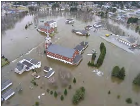
Figure 2. Flooding in Fort Kent, Maine, on May 1, 2008. The Maine Floodplain Management Program works with individuals, communities, and floodplain management professionals to reduce the risk of flooding.