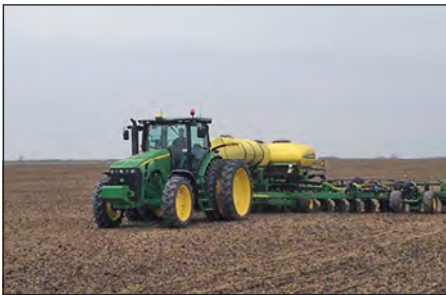
Figure 2. Enhanced elevation data aids precision farming, which improves crop yields, prevents soil degradation, minimizes groundwater usage, and helps farmers realize a larger return on their investments. The tractor is equipped with GPS and precision agriculture equipment, thus allowing for precise applications of seed and chemicals.