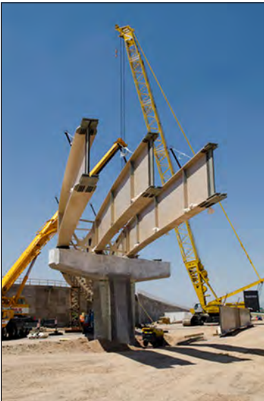
Figure 2. Lidar data reduces the time and cost associated with highway and other infrastructure projects, especially those that include significant earth moving, require accurate topographic data to solve drainage issues, estimate cut and fill requirements, and develop preliminary construction plans and design grades. Photograph of beams for the I-10 eastbound to I-25 northbound ramp near Las Cruces, New Mexico, being lowered into place.

The following examples highlight how 3DEP data can support business uses in New Mexico: (1) When lidar data are readily available, the need for traditional topographic land surveys (including infrastructure and construction site planning and estimating) is minimized. Reducing the time required for project planning provides a cost savings to the public. Lidar data can be used for preliminary highway alignment and design (fig. 2), evaluating existing roadway conditions, integration of geologic and environmental data, and input to hydraulic modeling for the design of structures (bridges and culverts) to accommodate runoff and flooding from large rain events. A statewide elevation dataset would facilitate communication and interoperability among