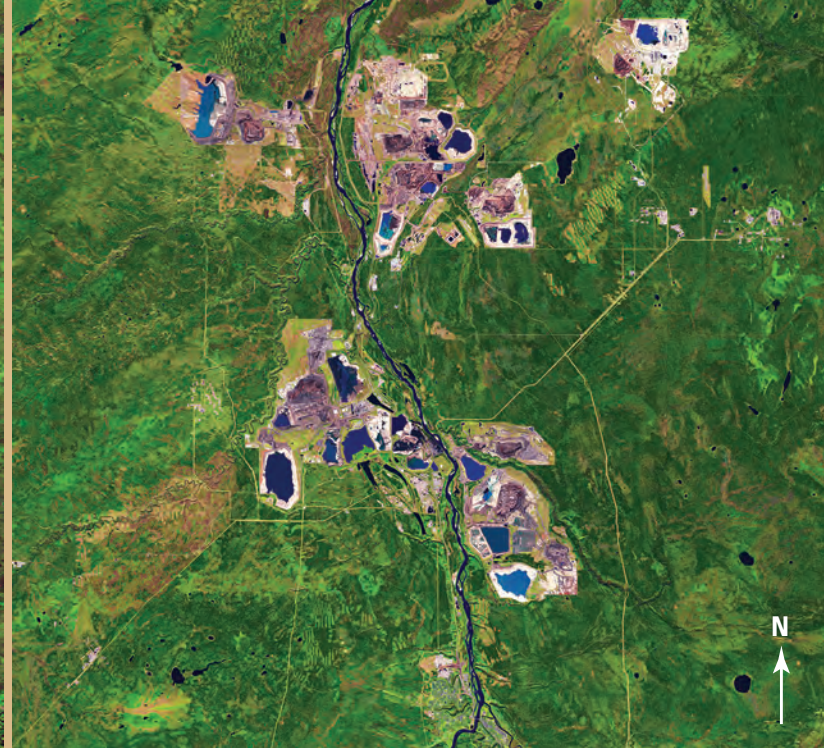
Figure 1. Landsat 1 (left image) on August 20, 1974, shows minimal open-pit mining activity near Fort McMurray, Alberta, Canada. Landsat 8 (right image) shows the dramatic difference on October 1, 2015, as open-pit mining is widely evident where oil is being extracted from tar sands and shipped by pipeline to the United States.

From 438 miles above Earth, Landsat satellite sensors collect data that help verify a central tenet of industrial growth across the world—the changing use of land to increase its economic output. Landsat satellite sensors capture industrialization data as Brazilian tropical forests are repurposed for soybean fields, and as open-pit mining in the tar sands of northern Alberta lays open the landscape to send oil flowing to the United States (fig. 1).