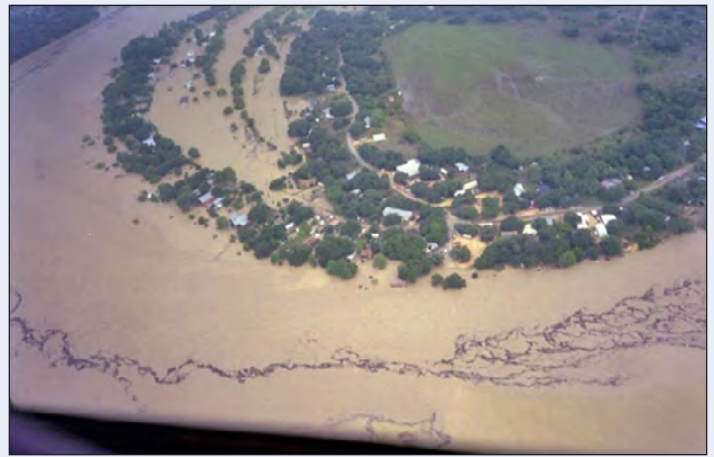
Figure 3. Inundation in the Medina River near Bandera, Texas, during the July 2002 flood.

Choi, N., and Engel, F.L., 2019, Flood-inundation maps for a 23-mile reach of the Medina River at Bandera, Texas, 2018: U.S. Geological Survey Scientific Investigations Report 2019–5067, 15 p., https://doi.org/10.3133/sir20195067 .