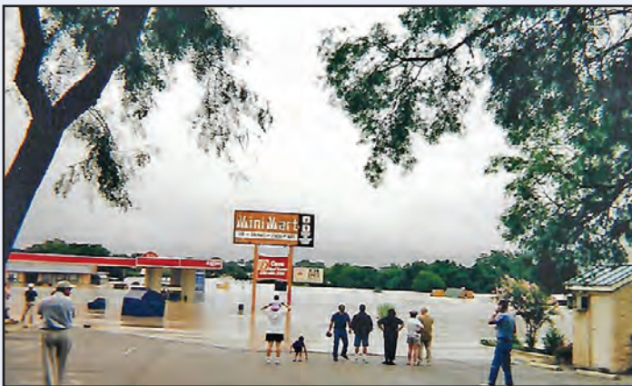
Figure 2. Northeast-oriented view of the Medina River in flood stage at State Route 16 near Bandera, Texas, July 2002 (photograph courtesy of Bandera County Honorable Judge Richard Evans).

The flood-inundation maps developed in this study, in conjunction with the real-time stage data from the Bandera station, are intended to help guide the public in taking individual safety precautions and provide emergency management personnel with a toolset to efficiently manage emergency flood operations and post-flood recovery efforts.