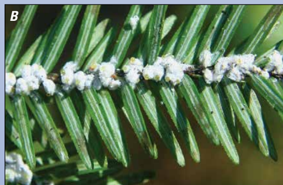
Eastern hemlock tree mortality in North America (A) from the hemlock woolly adelgid ( Adelges tsugae) (B), an insect accidentally introduced from Japan.