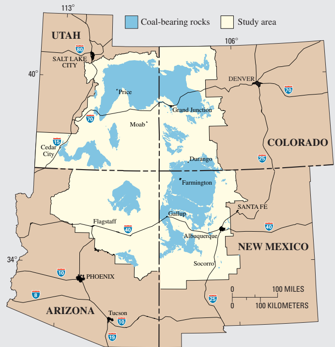
Figure 1 (above). Index map of Colorado Plateau Region showing study area, coal-bearing areas, major towns, and roads.