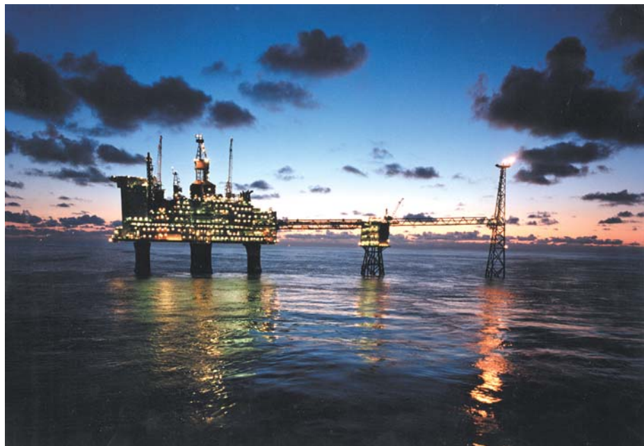
Figure 3. The Sleipner complex off the coast of Norway. Natural gas produced in the Sleipner field is high in CO 2 ; this CO 2 is removed from the natural gas stream and is then pumped into the Utsira Formation, which is a highly permeable sandstone. The operator of the Sleipner field, Statoil, geologically sequesters the CO 2 because the sequestration cost is less than the Norwegian carbon emission tax.

In addition to these tasks, the USGS is collaborating with the National Energy Technology Laboratory (NETL) of the U.S. Department of Energy and with the NETL-supported consortia GEO-SEQ and MIDCARB. Collaborative USGS activi-