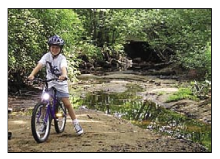
Depleted streamflow in the Ipswich River near Reading, Massachusetts