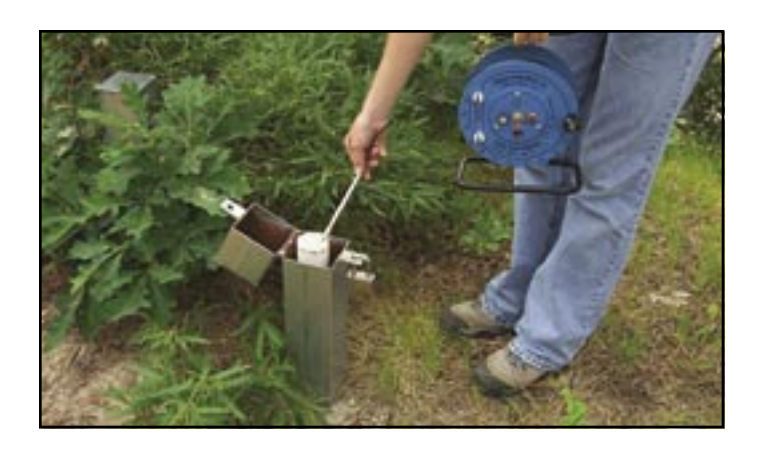
Ground-water-level monitoring, Cape Cod

Nearly half of Massachusetts drinking water comes from ground-water sources. In areas such as Cape Cod and the Plymouth-Carver region, virtually all public supplies are drawn from sole-source aquifers. The USGS, in cooperation with the Commonwealth, has conducted many ground-water assessments and modeling studies to enhance the protection, management, and restoration of Massachusetts ground-water resources. On Cape Cod, aquifer-cleanup activities at the Massachusetts Military Reservation have relied to a large extent upon USGS models of the underlying ground-water flow system. Most recently, the USGS is using new or existing models to delineate contributing areas to public-supply wells, ponds, and coastal embayments on Cape Cod, to determine optimal approaches to wastewater management, and to describe and help prevent the process of salt-water intrusion in coastal areas.