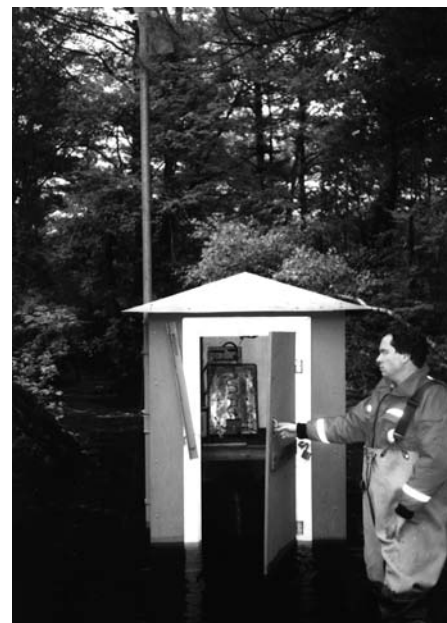
Photo. USGS Hydrologist inspecting a flooded gaging station along the Wading River near Norton, Massachusetts

Additional earth science information can be found by accessing the USGS Home Page on the World Wide Web at http://www.usgs.gov