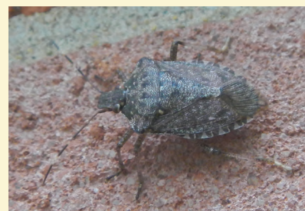
The brown marmorated stink bug ( Halyomorpha halys ) is a common insect pest on crops and in homes throughout much of the eastern United States. This invasive species was accidentally introduced from Asia in the late 1990s (USGS, 2019).

BISON uses standardized scientific names for searching on the website and a hierarchy and synonymy supplied by the Integrated Taxonomic Information System (ITIS, 2019). For example, users can search for an exact name match to see occurrences only identified as genus Poa , or (with an ITIS-assisted search) choose to include all taxonomic children and synonyms (and see records for all of the species, subspecies, and varieties of Poa , along with all of their synonyms). Names not in ITIS can be searched only as exact matches, but 95 percent of the taxa represented in BISON are found in ITIS. BISON also offers an ITIS Enabled Common Name Search option.