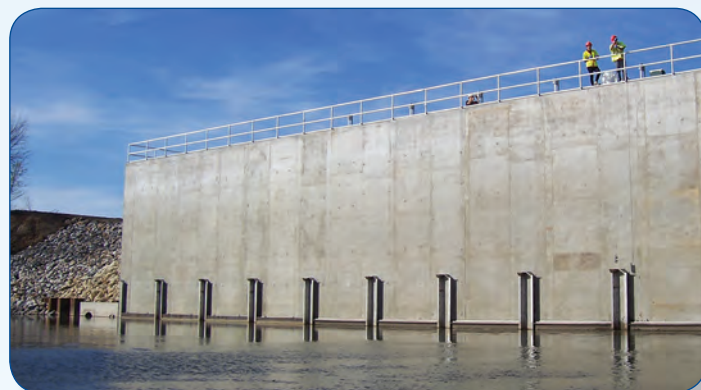
Aquifer Storage and Recovery Phase II intake structure along the Little Arkansas River, Kansas