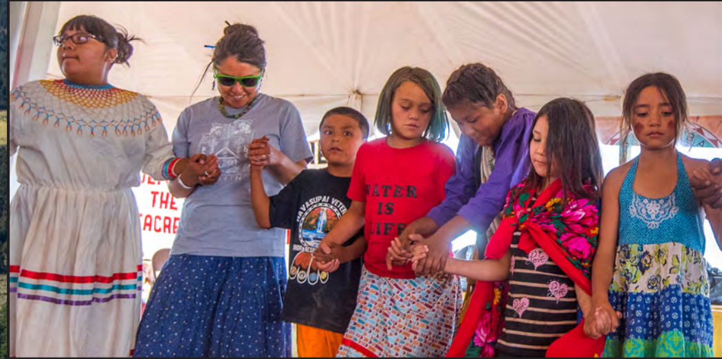
Havasupai members practicing traditional ceremonies at a Red Butte gathering. Connections with the surrounding environment are central to Havasupai culture.