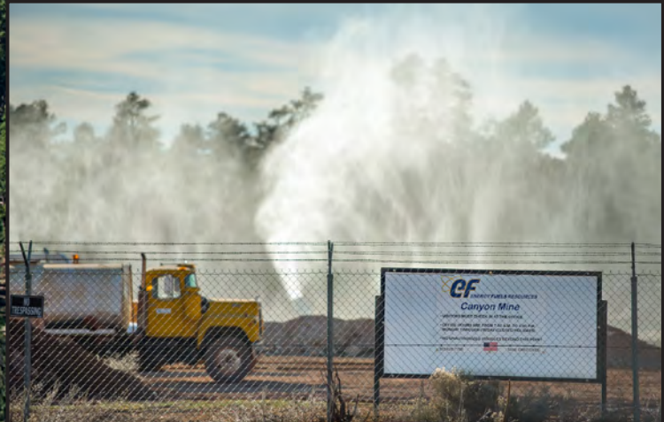
Mine water sprayed into the air to help with pond dewatering in 2017 at Pinyon Plain Mine led to concerns from the Havasupai that contamination will move offsite.

EXPLANATION Indigenous exposure pathways Standard scientific pathways