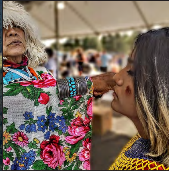
Havasupai elder putting red ochre on the face of a Havasupai youth at a Tribal gathering.