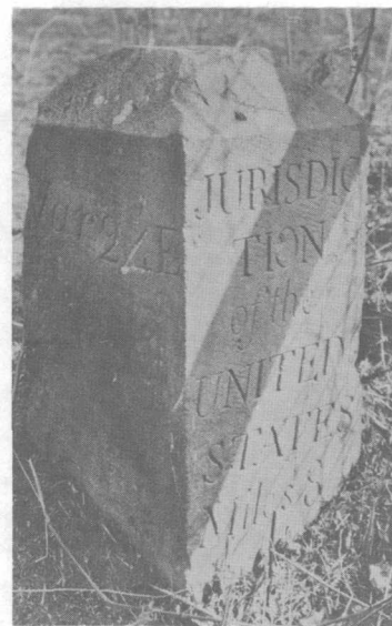
Original Federal boundary marker of the District of Columbia.