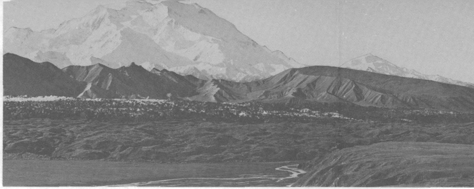
Mount McKinley in Alaska is the loftiest peak in North America.