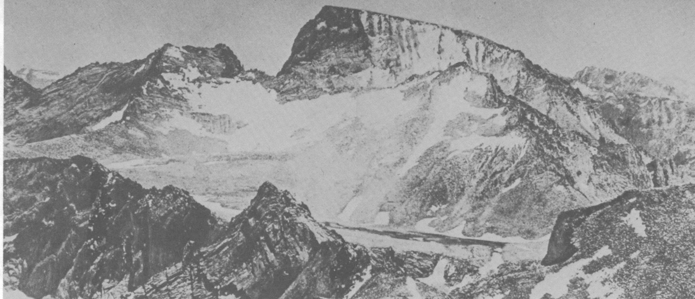
Mount Whitney, highest point in the conterminous 48 States, is less than 80 miles from Death Valley, which is the lowest point.