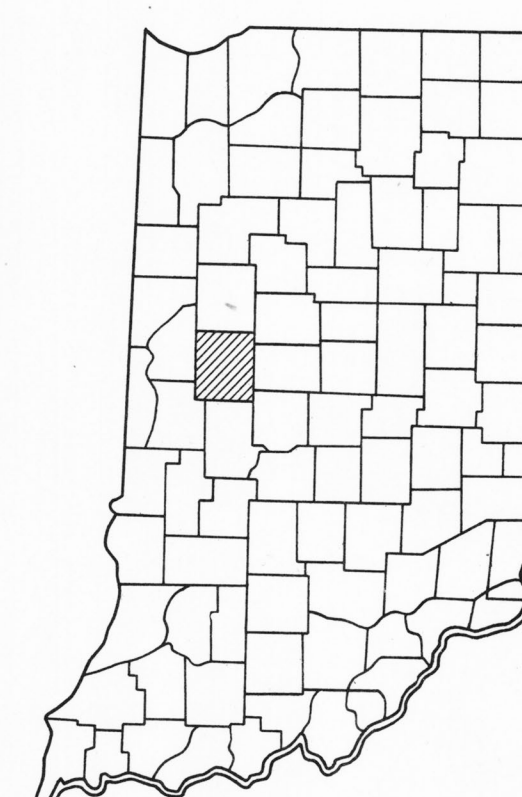
Index map of Indiana showing Montgomery County

This aeromagnetic map is one of a series of county maps based on a state-wide aeromagnetic survey of Indiana which was carried out during the periods September to November 1947 and September to November 1948 by the U. S. Geological Survey in cooperation with the Division of Geology of the Indiana Department of Conservation.