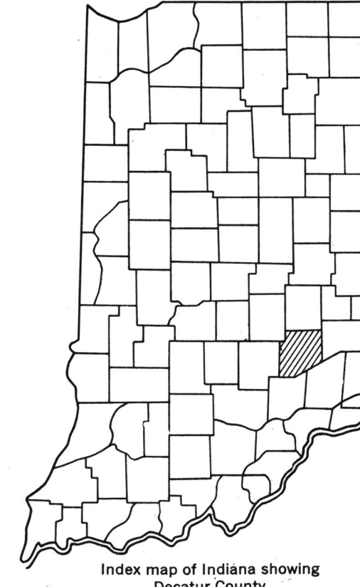
Index map of Indiana showing Decatur County