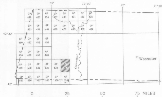
INDEX MAP OF WESTERN MASSACHUSETTS SHOWING AEROMAGNETIC MAPS PUBLISHED BY THE U.S. GEOLOGICAL SURVEY AREA OF GP-537 SHADED

Aeromagnetic data are obtained and compiled along a continuous line, whereas ground magnetic surveys are made at separate points. Errors within the normal limits of any magnetic measurement may cause slight discrepancies between flight lines in an aeromagnetic map, which would be more obvious than similar discrepancies between points in a ground magnetic map. For this reason as much care should be exercised in evaluating magnetic features that appear as elongations along a single aeromagnetic traverse as in interpreting an anomaly indicated by a single ground station