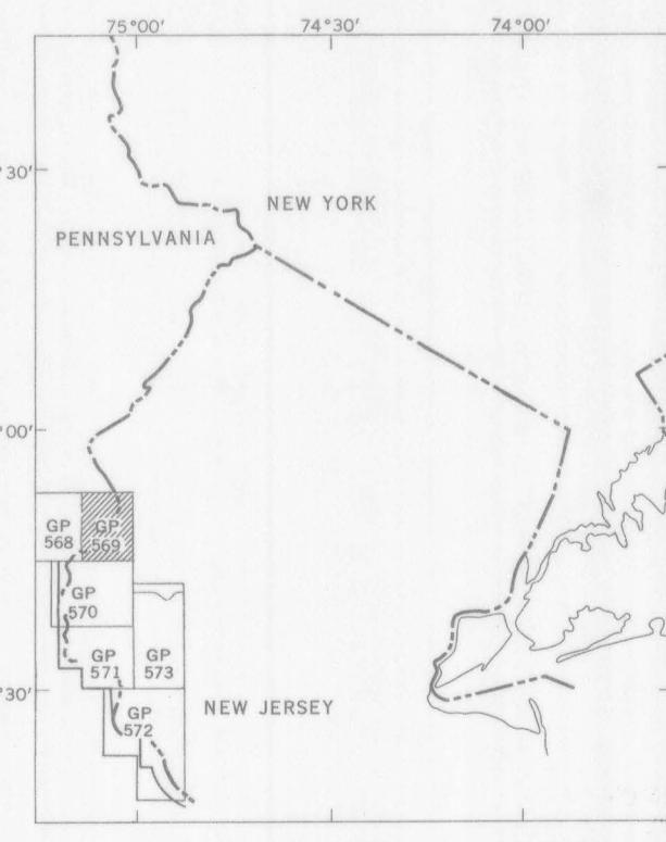
INDEX MAP SHOWING LOCATION OF AERORADIOACTIVITY MAPS PUBLISHED BY THE U.S. GEOLOGICAL SURVEY IN NEW JERSEY AND ADJACENT PARTS OF PENNSYLVANIA. AREA OF GP-569 SHADED.

NOTE The aeroradioactivity data were obtained with continuously recording scintillation detection equipment which utilizes thallium-activated sodium iodide crystals. The equipment measures gamma radiation with energy levels greater than 50 kev (thousand electron volts). The effective area of response of the scintillation equipment at an altitude of 500 feet above ground is approximately 1000 feet in diameter. The presence of water within the area of response will lower the terrestrial radioactivity, as water absorbs gamma radiation. The amount of fallout present is negligible and assumed to be uniformly distributed.