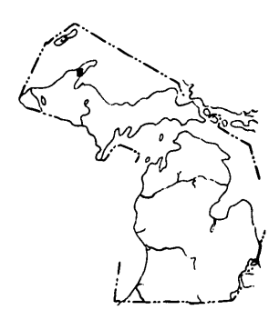
INDEX MAP OF MICHIGAN