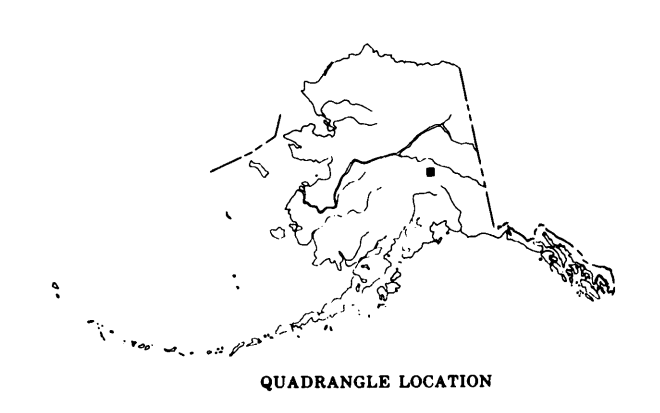
PUBLISHED BY THE U.S. GEOLOGICAL SURVEY WASHINGTON, D. C. 1970