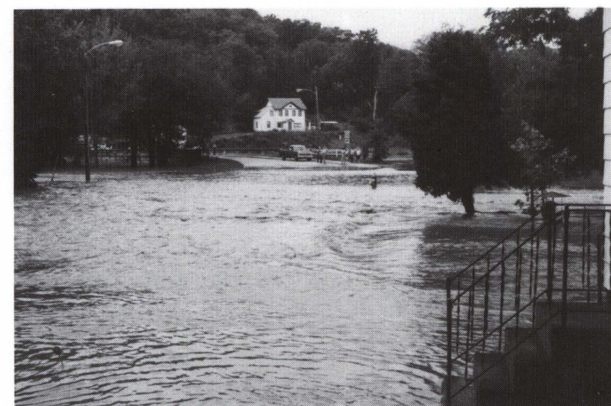
GAYS MILLS—View looking west toward Highway 171 bridge over the Kickapoo River