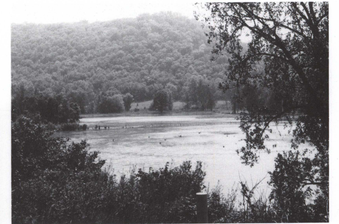
KICKAPOO RIVER VALLEY—View from east bank between Gays Mills and Steuben