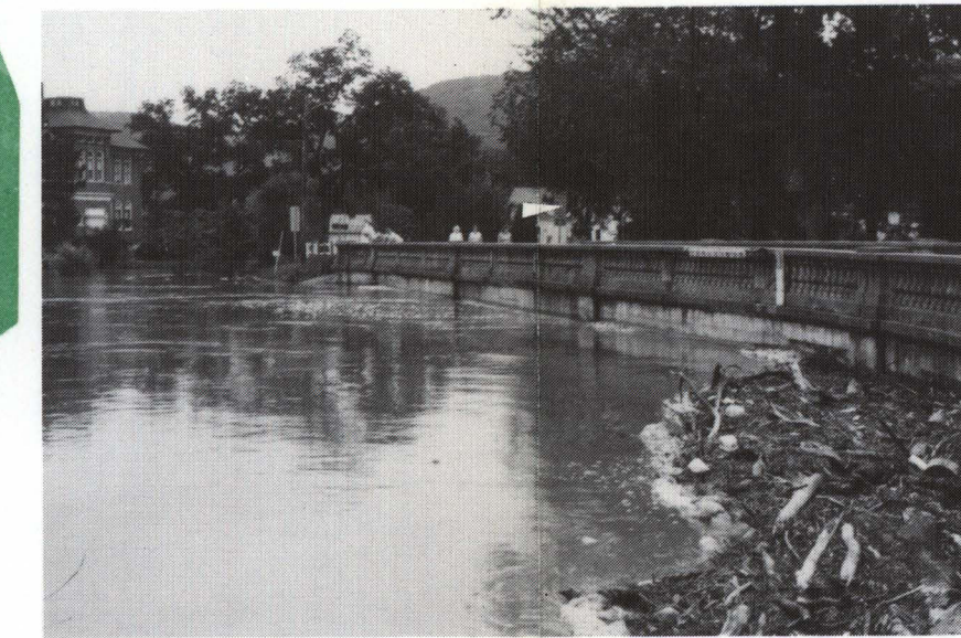
GAYS MILLS—View looking east at upstream side of Highway 171 bridge