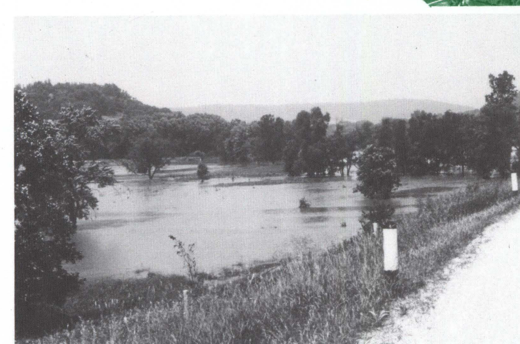
KICKAPOO RIVER—Between Gays Mills and Steuben

UNRECTIFIED AERIAL PHOTOS TAKEN JULY 5, 1978 SCALE APPROXIMATELY 1:18,000 (1" = 1800') FLOOD DELINEATIONS BASED ON FIELD SURVEY AND LARGE SCALE TOPOGRAPHIC MAPS