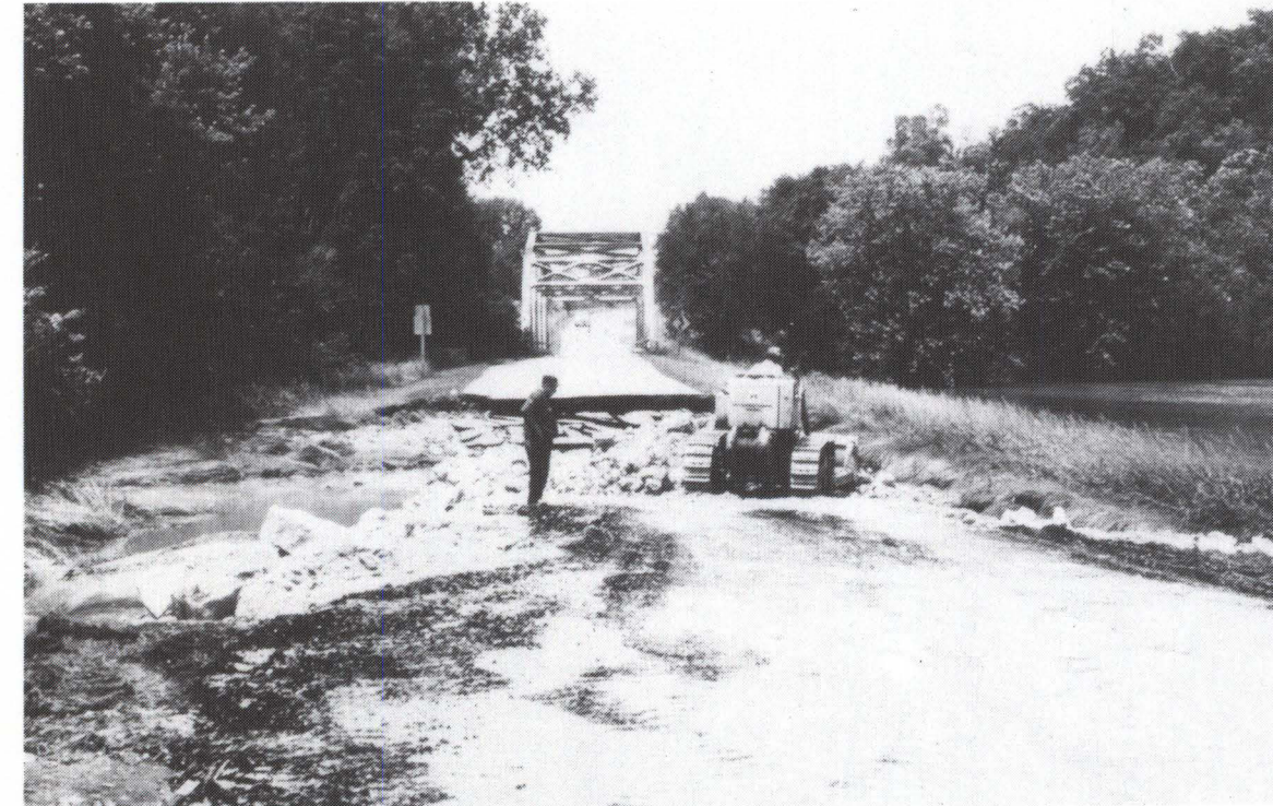
COUNTY HIGHWAY B