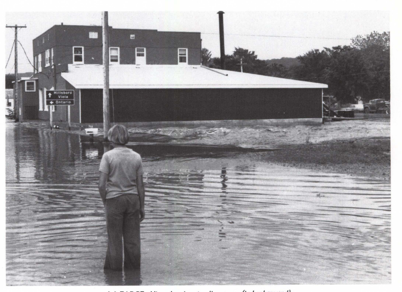
LA FARGE—View showing standing waves (in background)