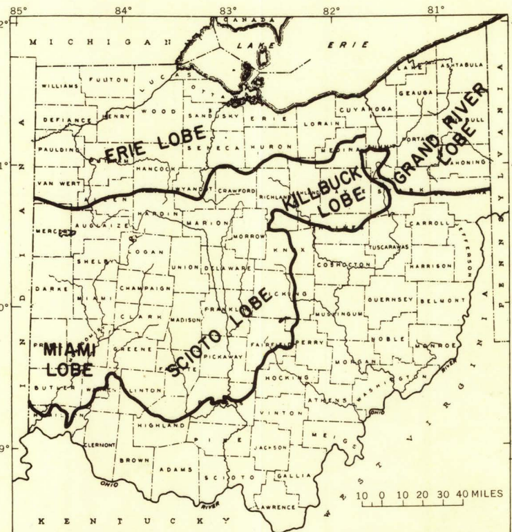
MAP SHOWING THE APPROXIMATE POSITIONS OF THE MAJOR GLACIAL LOBES