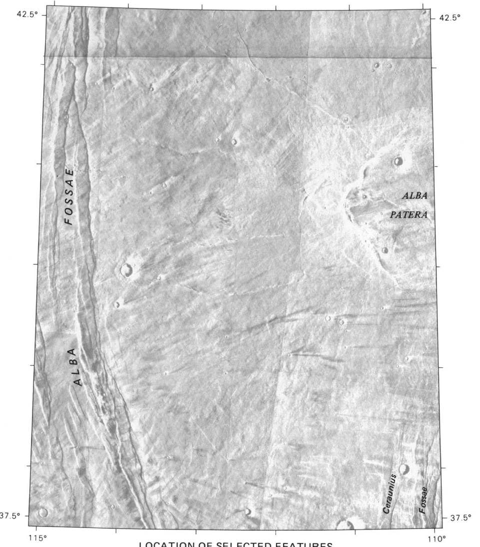
LOCATION OF SELECTED FEATURES Contrast in the reduced base mosaic was purposely suppressed to emphasize the names.

NOTE TO USERS Users noting errors or omissions are urged to indicate them on the map and to forward it to U.S. Geological Survey, Building 4, Room 454, 2255 North Gemini Drive, Flagstaff, Arizona 86001. A replacement copy will be returned.