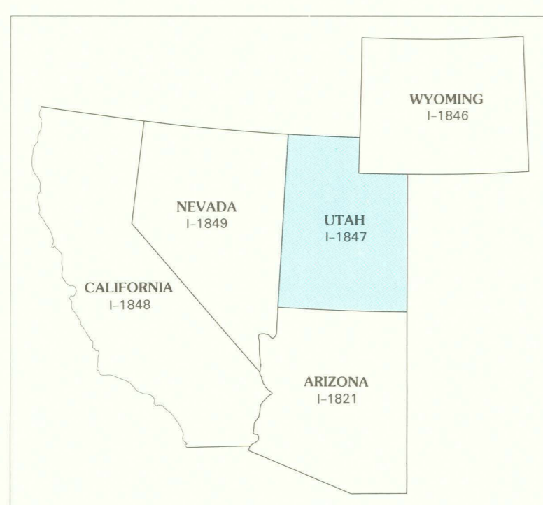
INDEX OF PUBLISHED EXPERIMENTAL SHADED-RELIEF MAPS Published maps are indicated by an "I" series number.