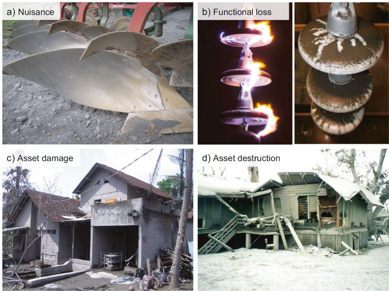
Fig. 3. Photos of impacts to the built environment at different consequence severity and for different volcanic hazards: (a) Nuisance: minor corrosion to farming equipment that occurred overnight (observed by the photographer and confirmed by the farmer) as a result of gas and/or tephra during the explosive phase of the 2010 eruption of Eyjafjallajökull, Iceland (credit: SF Jenkins); (b) Functionality loss: tephra induced flashover (short-circuiting) across a porcelain insulator during laboratory experiments (left) and the thin layer of damp tephra responsible (right) (credit: JB Wardman and G Wilson); (c) Asset damage: cracked window glass and melting of plastic components such as light fixtures (center), plastic piping and water tank (upper right), and PVC sheet roofs (rear of property) by low-energy, dilute pyroclastic density currents during the 2010 eruption of Merapi, Indonesia (credit: SF Jenkins); (d) Asset destruction: roof collapse and structural damage to walls from ~ 50 cm of tephra fall on a timber frame building during the 1994 eruption of Rabaul, Papua New Guinea (credit: RJ Blong)