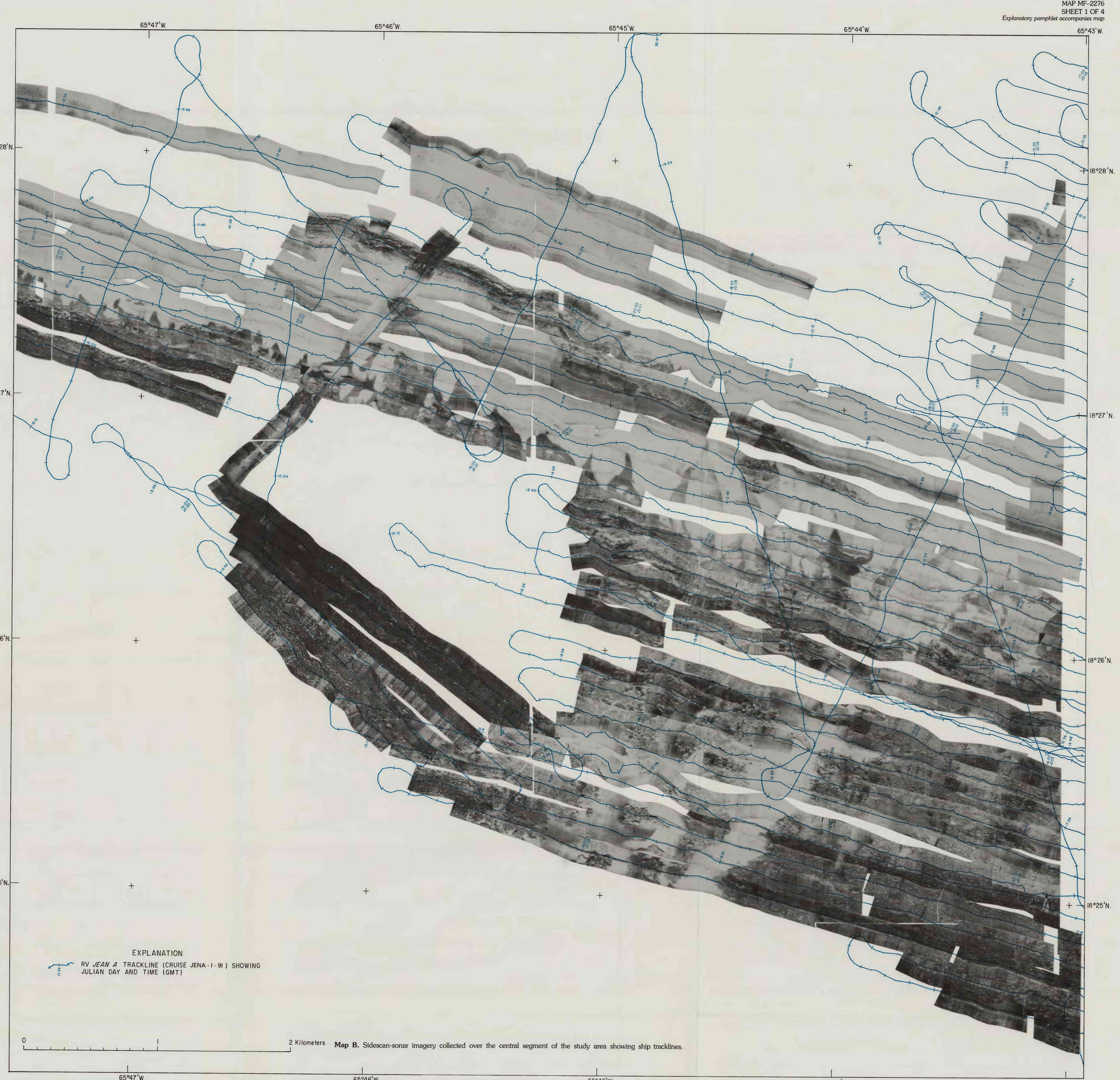
Map B. Side-scan-sonar imagery collected over the central segment of the study area showing ship tracklines.

Manuscript approved for publication September 5, 1994