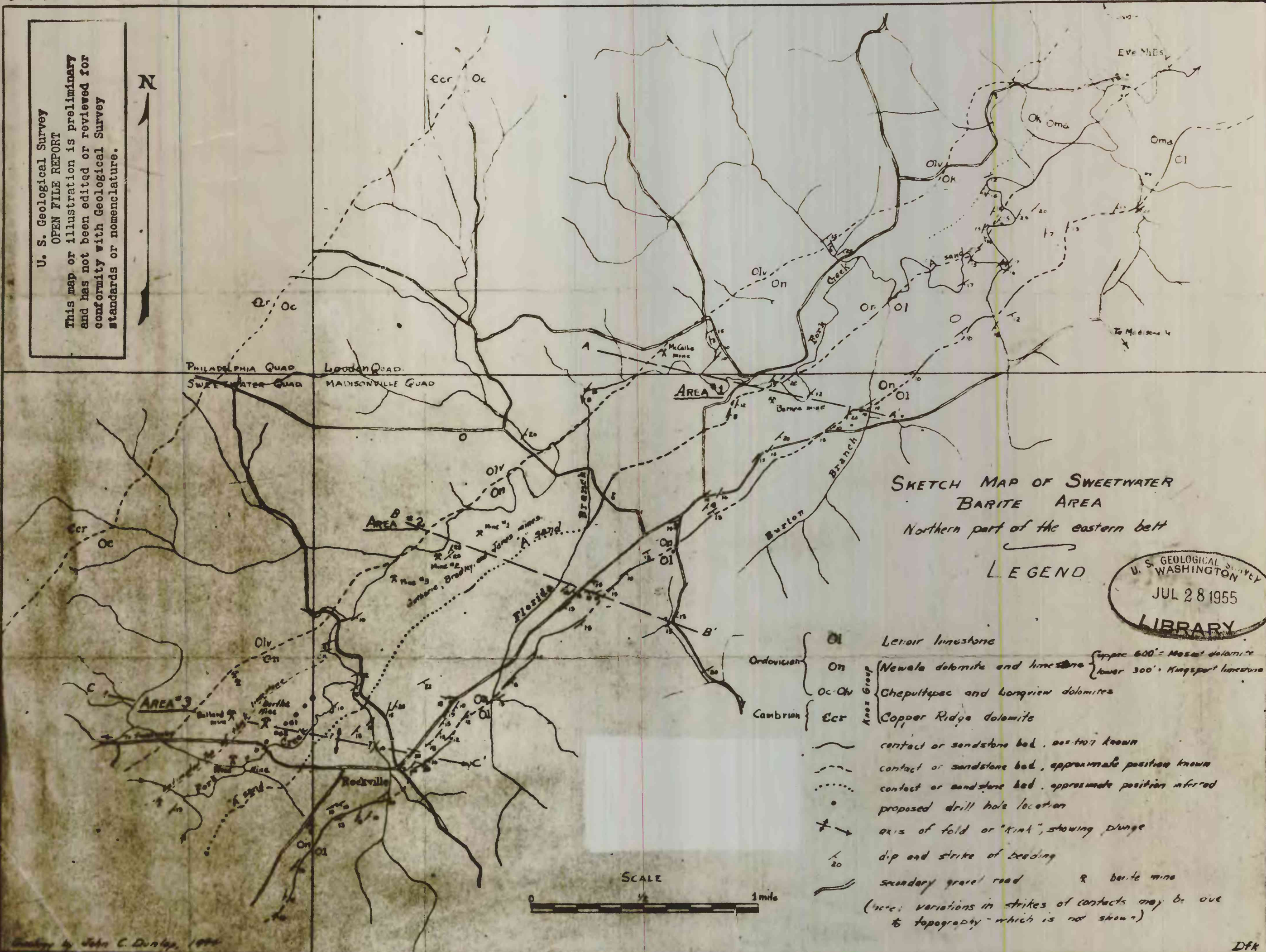
SKETCH MAP OF SWEETWATER BARITE AREA Northern part of the eastern belt