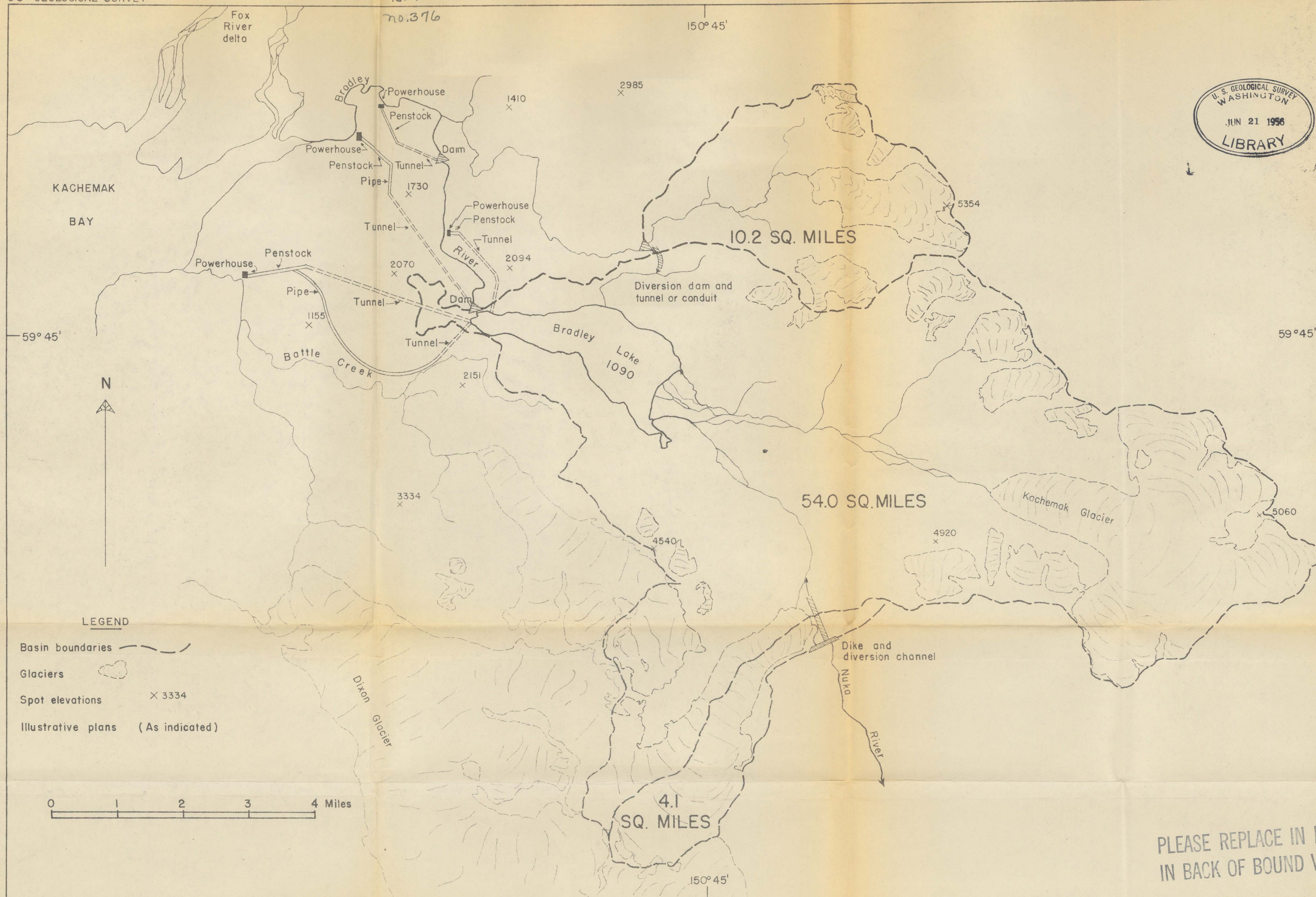
PLATE 3 ILLUSTRATIVE PLAN OF WATERPOWER DEVELOPMENT FOR BRADLEY LAKE, ALASKA

PLEASE REPLACE IN POC IN BACK OF BOUND VOLL