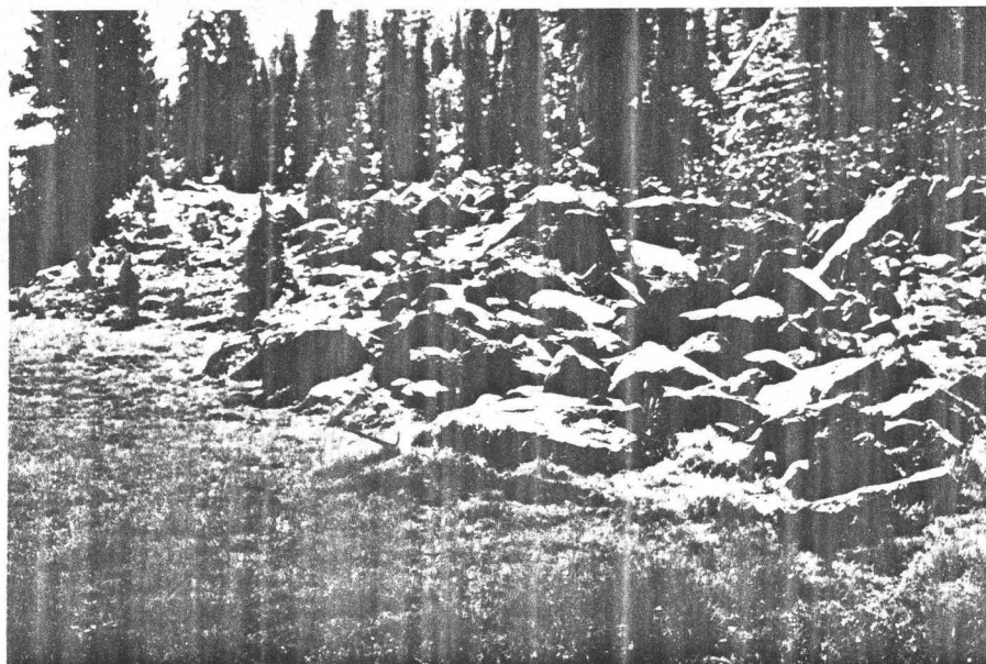
Figure 37 27 .--Talus creep(?) near divide between Leroux and Leon Creek drainages. Note disrupted soil at leading edge of talus field.

PLEASE REPLACE IN POCKET IN BACK OF COVER VOLUME