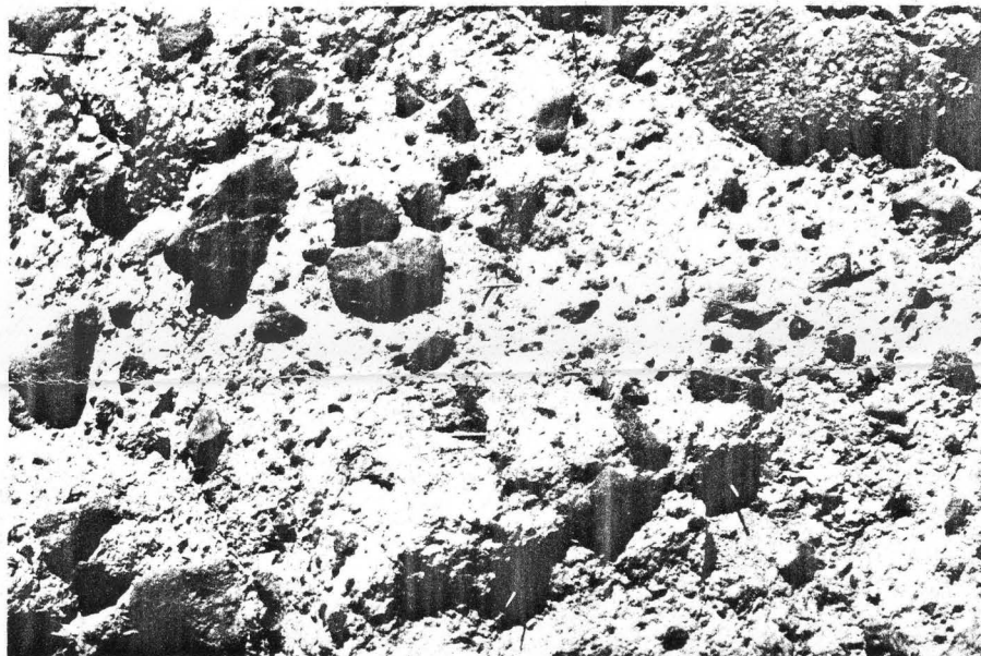
36. Till of the Grand Mesa Formation exposed along gravel road in Cottonwood Creek 1 mile southeast of Molina (location 18). Toothpicks were used to measure long-axis attitudes

PLEASE REPLACE IN POCKET IN BACK OF BOUND VOLUME