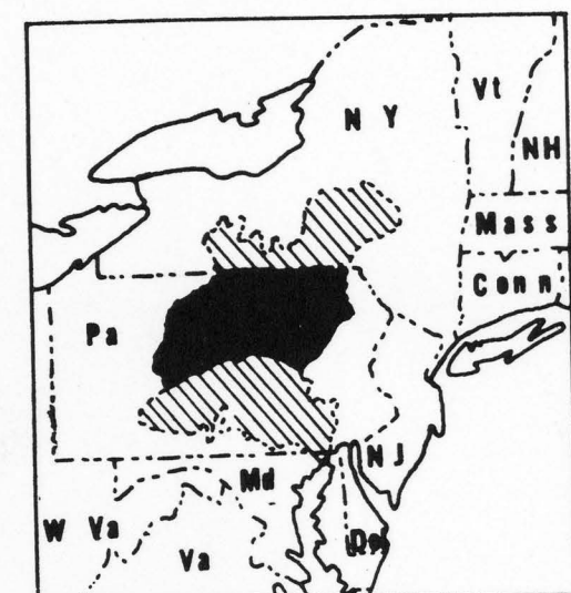
Susquehanna and Upper Susquehanna River Basin in Pennsylvania