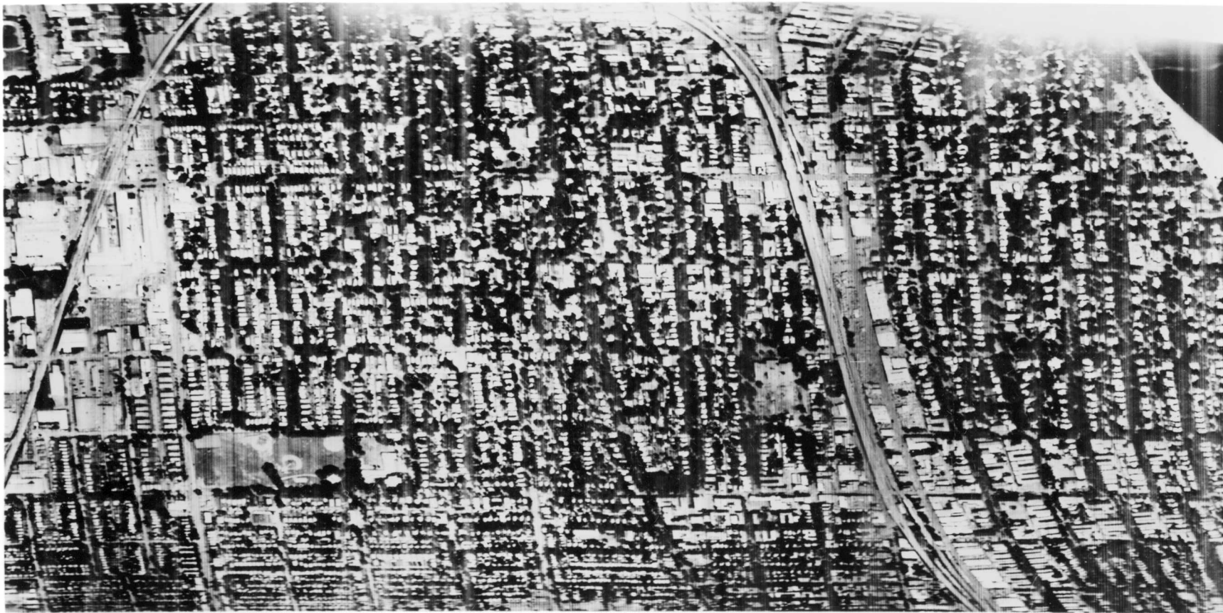
Figure 2. Reconnofax IV Scanner Imagery (8-14u) of portion of Evanston, Illinois.