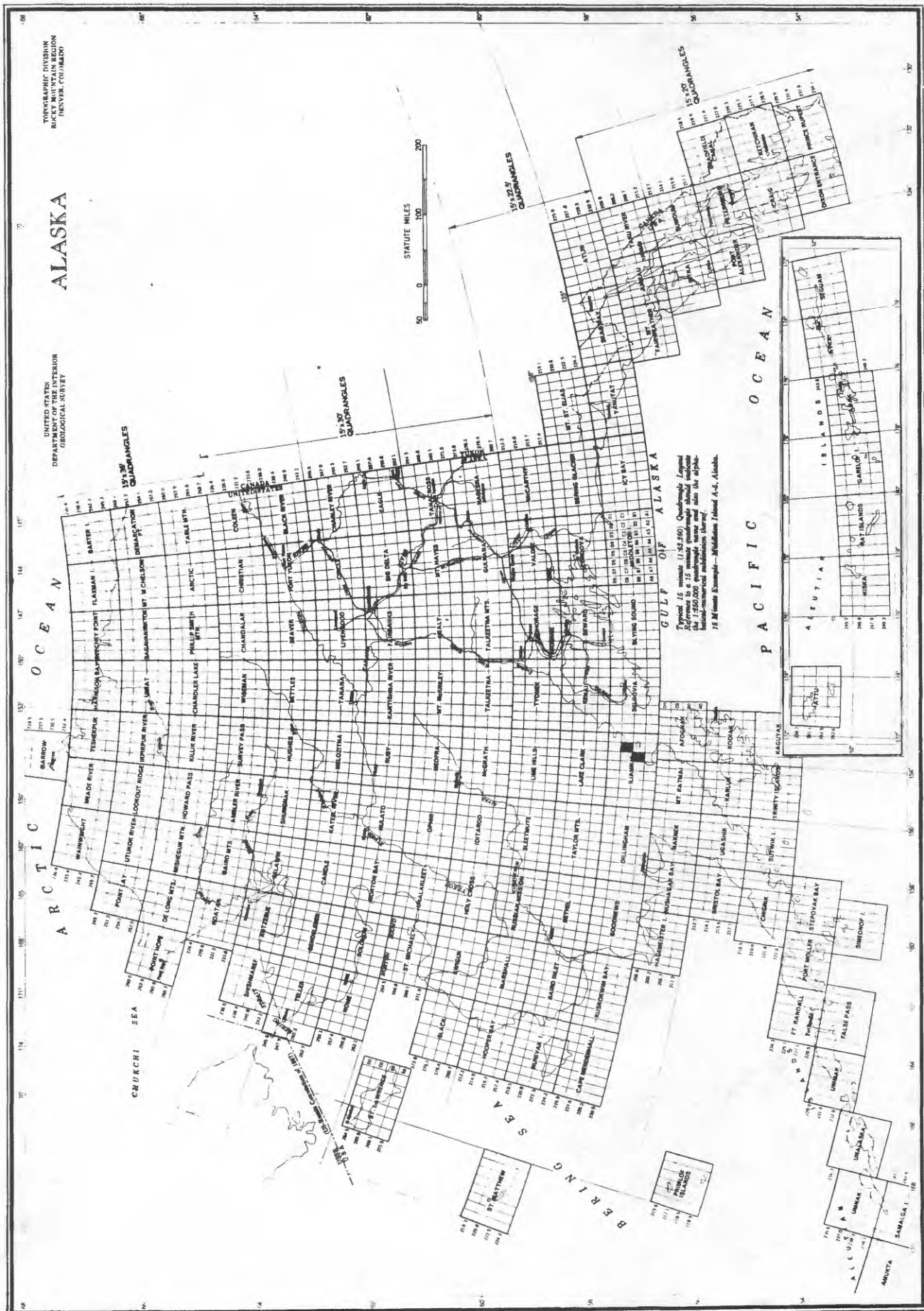
Figure 1 Index map showing location of Iliamna B-3 (Bruin Bay) and C-2 (Iliamna Bay) Quadrangles, Alaska