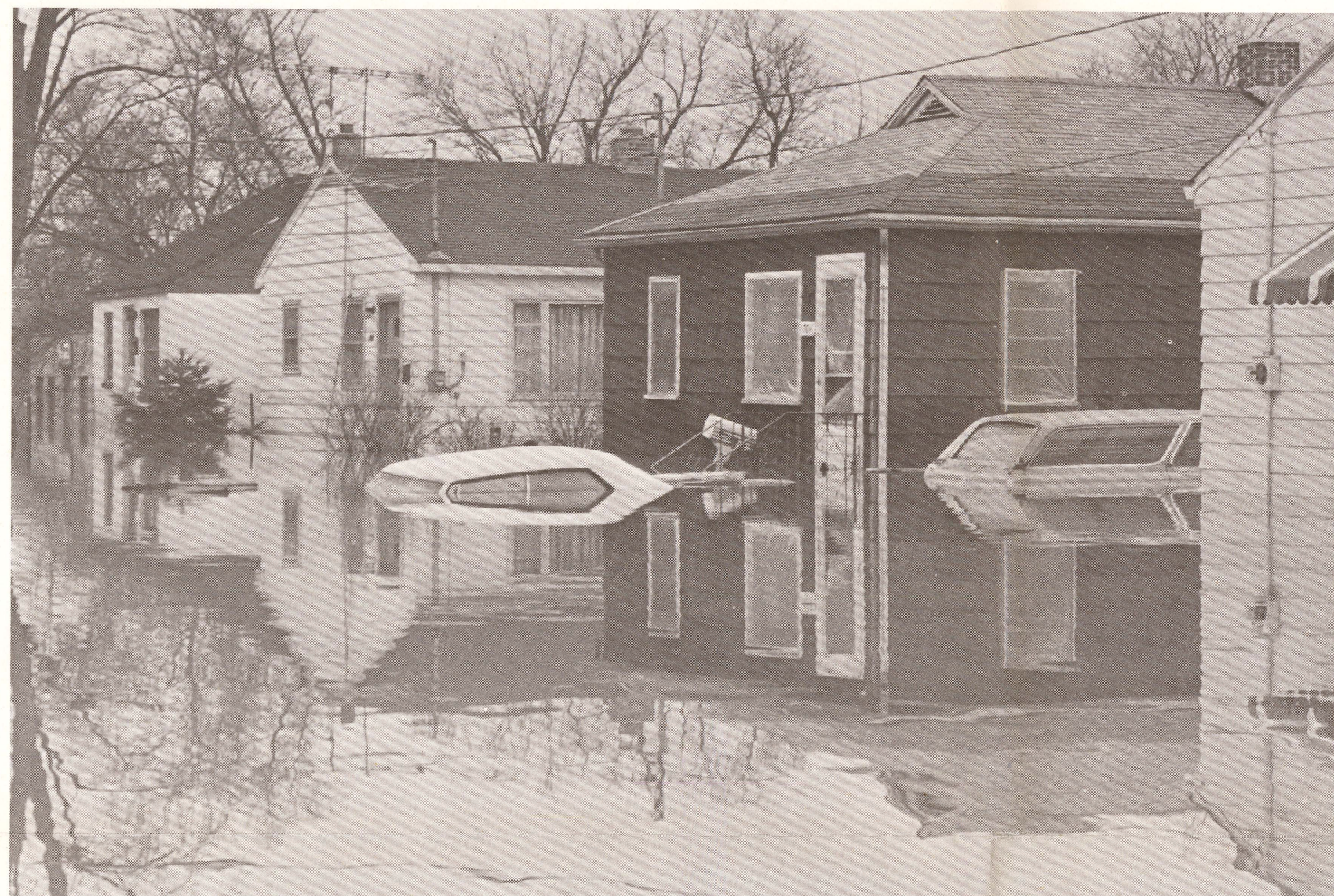
FIGURE 14.--Overflow of the Red Cedar River in the southeastern part of Lansing.