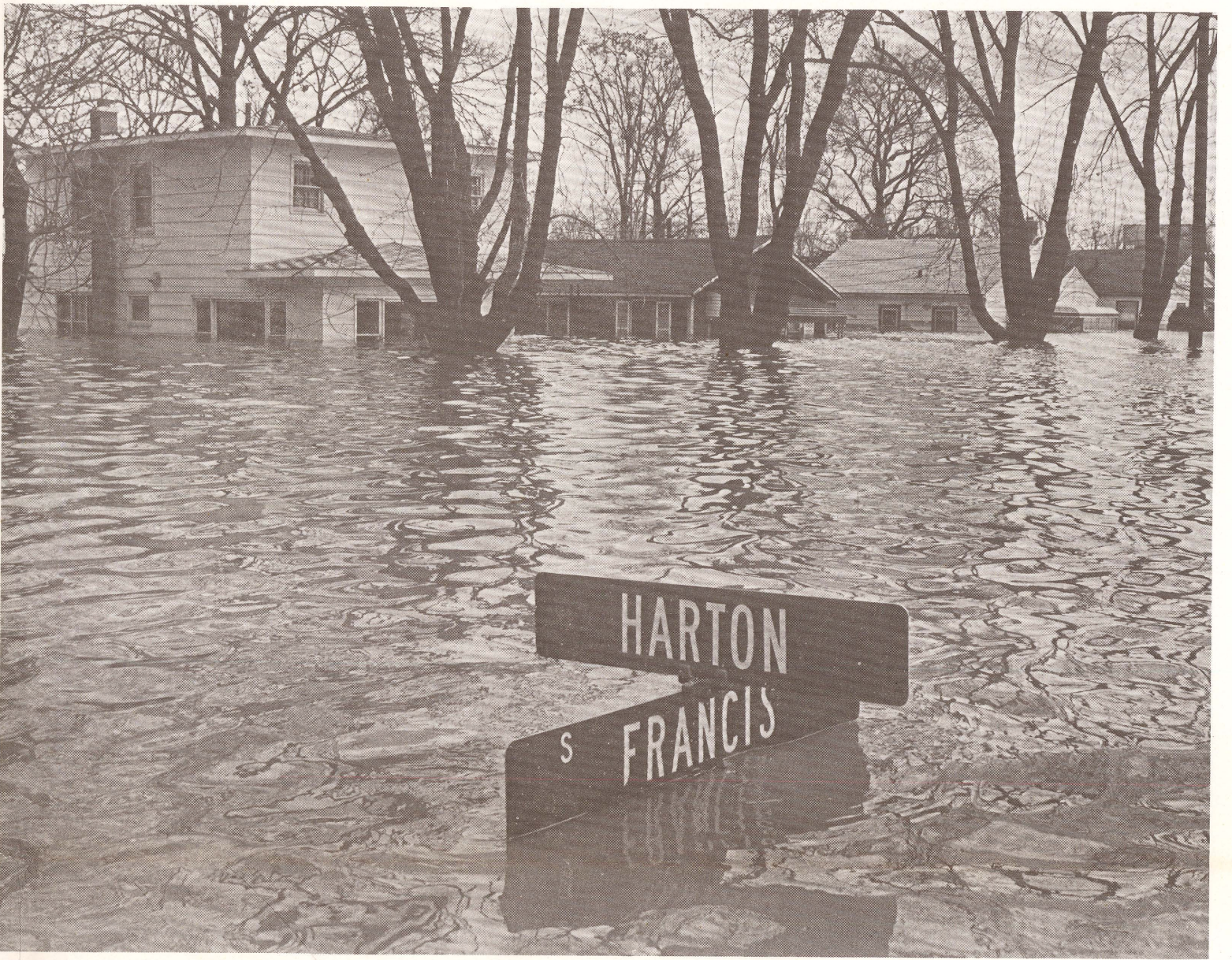
FIGURE 12.--Overflow of the Red Cedar River in the southeastern part of Lansing.