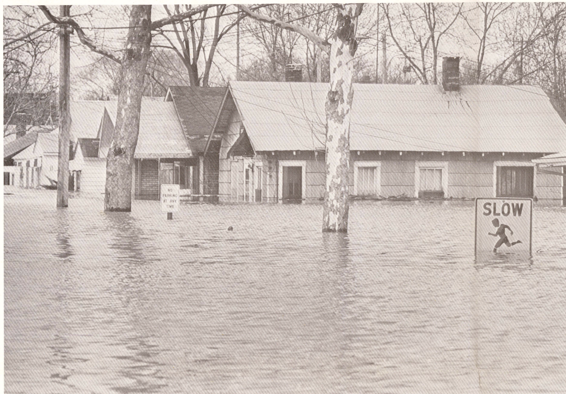
FIGURE 13.--Overflow of the Red Cedar River in the southeastern part of Lansing.