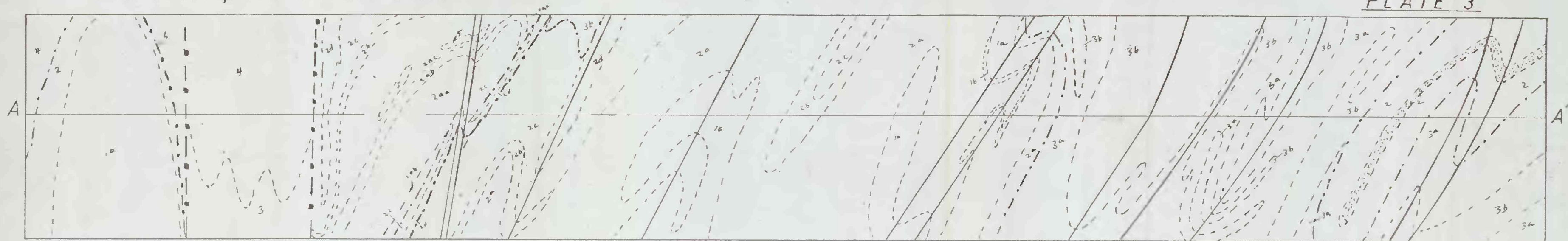
SCHEMATIC STRUCTURE SECTION ACROSS a PART of the NORTHWEST ADIRONDACKS, NEW YORK