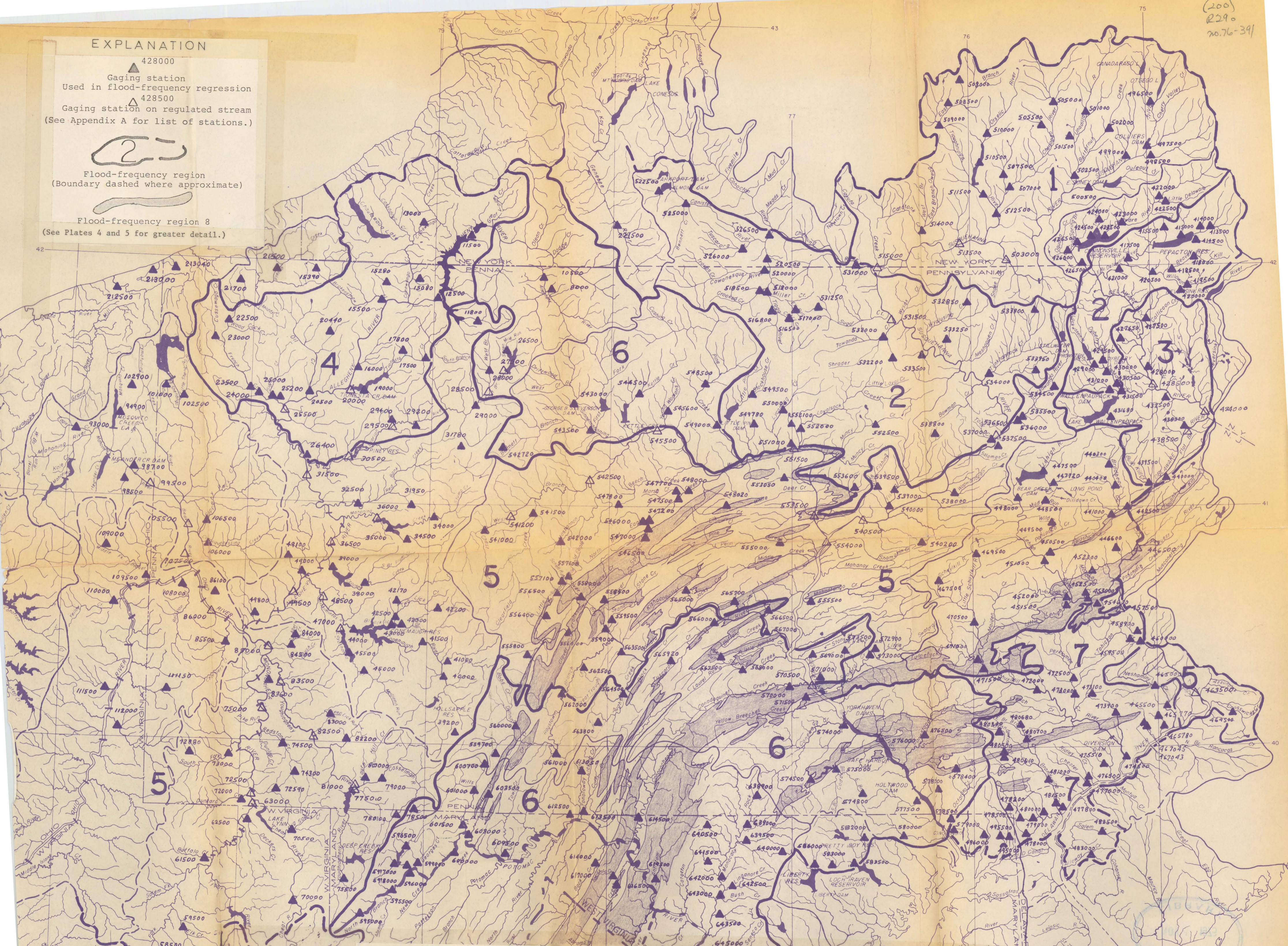
PLATE 1.--Drainage map of Pennsylvania showing locations of gaging stations and flood-frequency regions.

Flood-frequency region 8 (See Plates 4 and 5 for greater detail.)