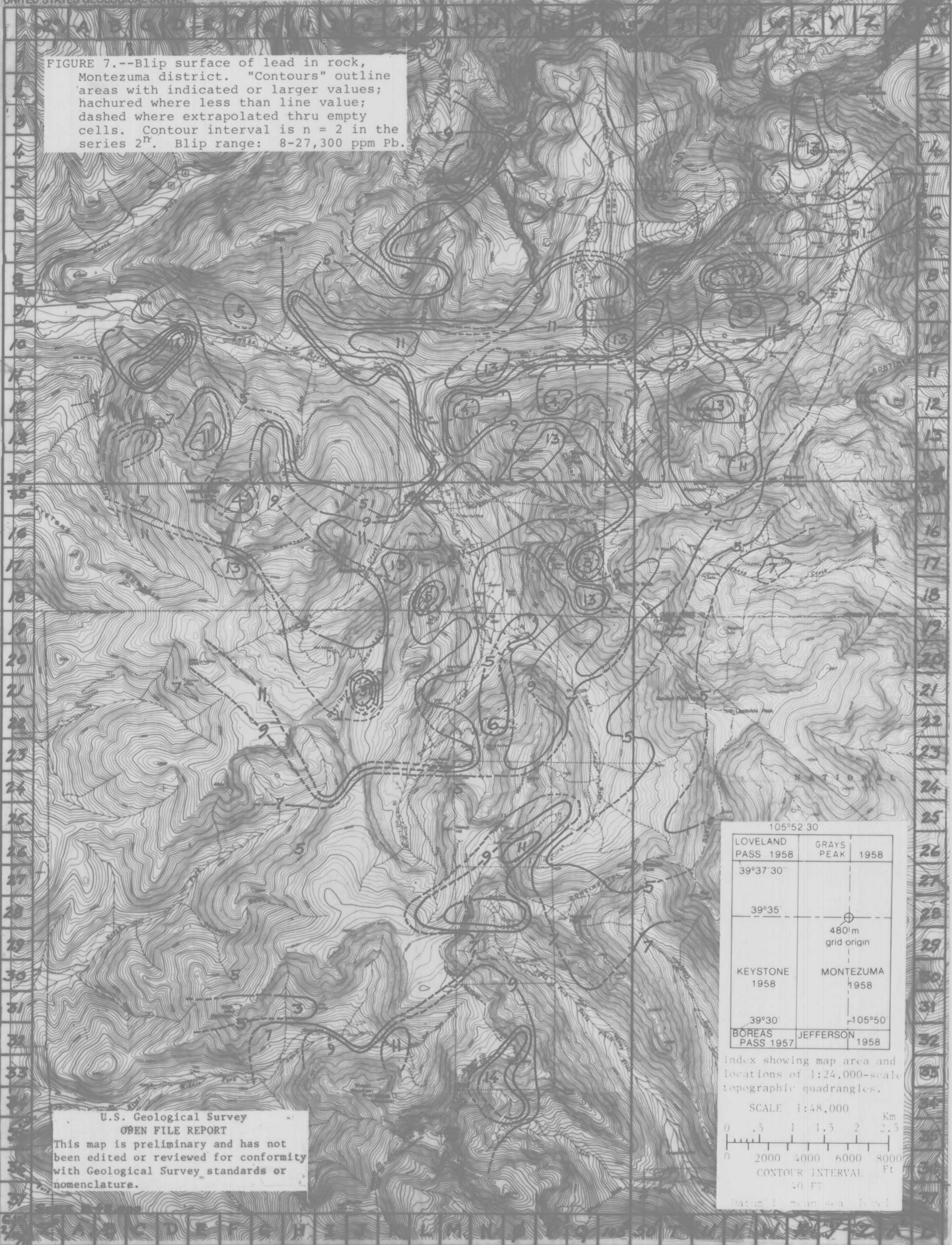
FIGURE 7.--Blip surface of lead in rock, Montezuma district. "Contours" outline areas with indicated or larger values; hachured where less than line value; dashed where extrapolated thru empty cells. Contour interval is n = 2 in the series 2^n . Blip range: 8-27,300 ppm Pb.