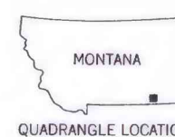
PLATE 57 AREAL DISTRIBUTION OF IDENTIFIED RESOURCES OF THE NANCE COAL BED