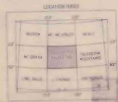
Figure 1.--Map of Talkeetna quadrangle showing sites at which bulk heavy-mineral concentrate samples were collected

CONTOUR INTERVAL 200 FEET (ELEVATION MEAN SEA LEVEL)