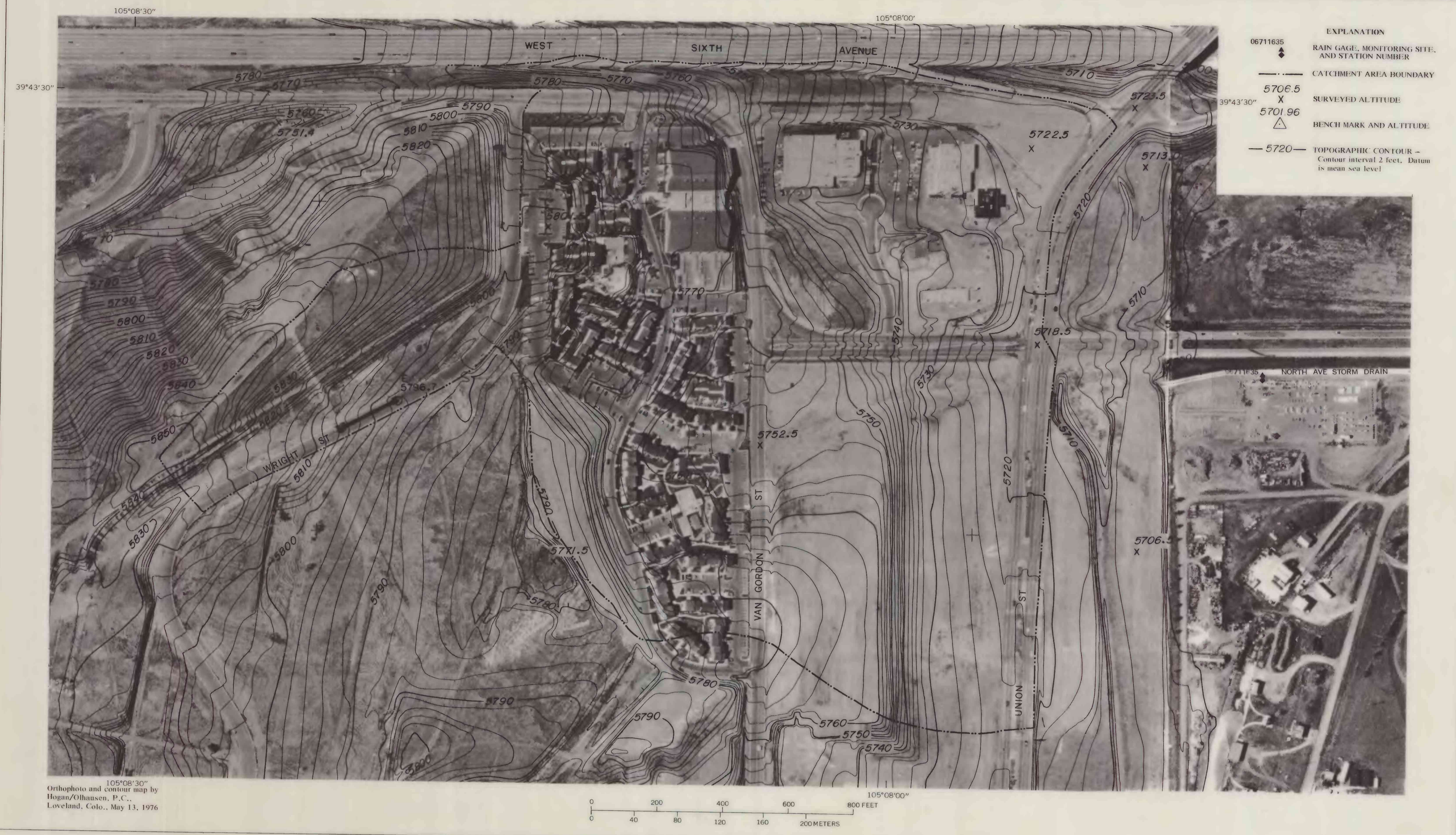
ORTHOPHOTOMAP SHOWING TOPOGRAPHIC CONTOURS, OUTLINE OF STUDY AREA, AND LOCATION OF RAIN GAGE AND MONITORING SITE FOR THE CATCHMENT AREA DRAINED BY NORTH AVENUE STORM DRAIN, DENVER FEDERAL CENTER, LAKEWOOD, COLORADO