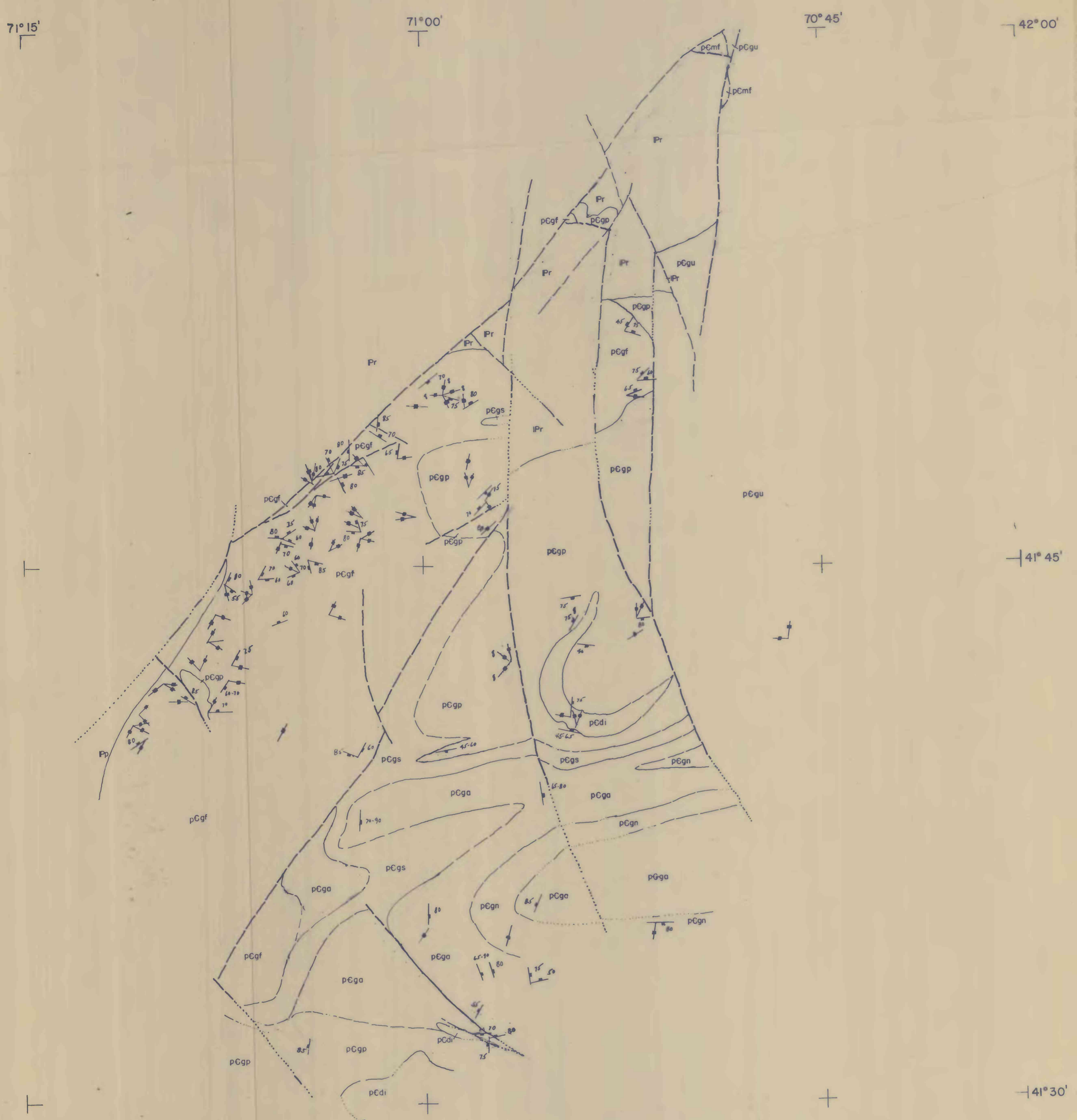
FIG. 1 MAP SHOWING JOINTS IN THE FALL RIVER - NEW BEDFORD AREA, MASSACHUSETTS