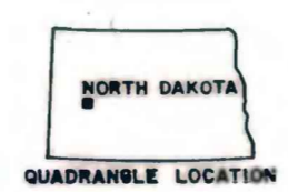
COAL RESOURCE OCCURRENCE MAP OF THE DUNN CENTER NE QUADRANGLE, DUNN COUNTY, NORTH DAKOTA BY WOODWARD-CLYDE CONSULTANTS 1978