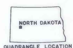
COAL RESOURCE OCCURRENCE MAP OF THE DUNN CENTER NW QUADRANGLE, DUNN COUNTY, NORTH DAKOTA BY WOODWARD-CLYDE CONSULTANTS 1978