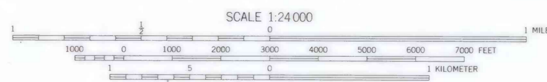
PLATE 18 IDENTIFIED RESOURCES OF UPPER WYODAK COAL BED