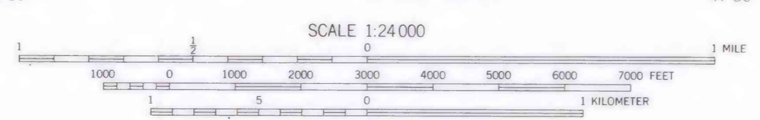
PLATE 24 ISOPACH MAP OF PAWNEE-WILDCAT-MOYER-OEDEKOVEN COAL ZONE