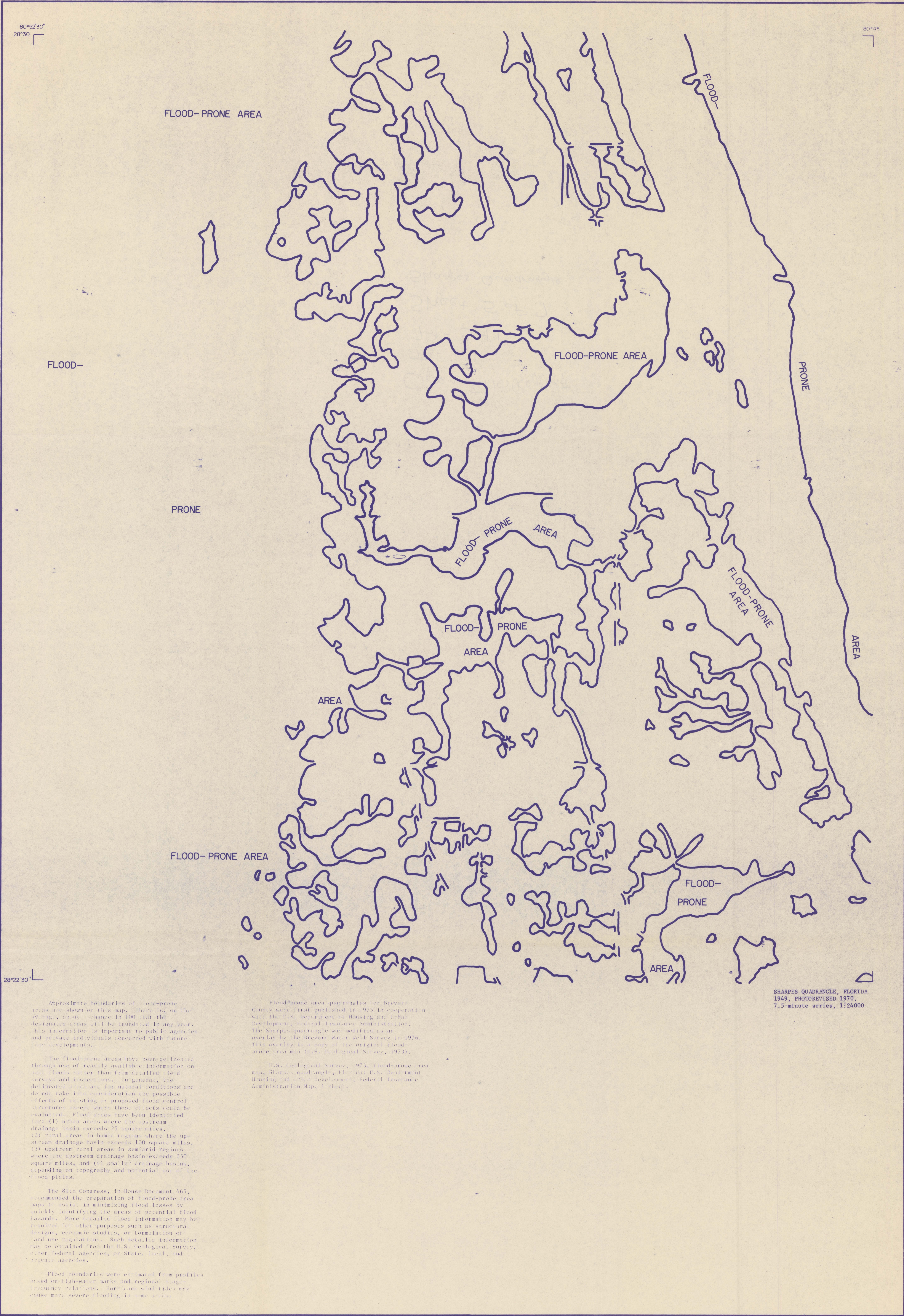
SHARPES QUADRANGLE, FLORIDA 1949, PHOTOREVISED 1970, 7.5-minute series, 1:24000

Approximate boundaries of flood-prone areas are shown on this map. There is, on the average, about 1 chance in 100 that the designated areas will be inundated in any year. This information is important to public agencies and private individuals concerned with future land developments.