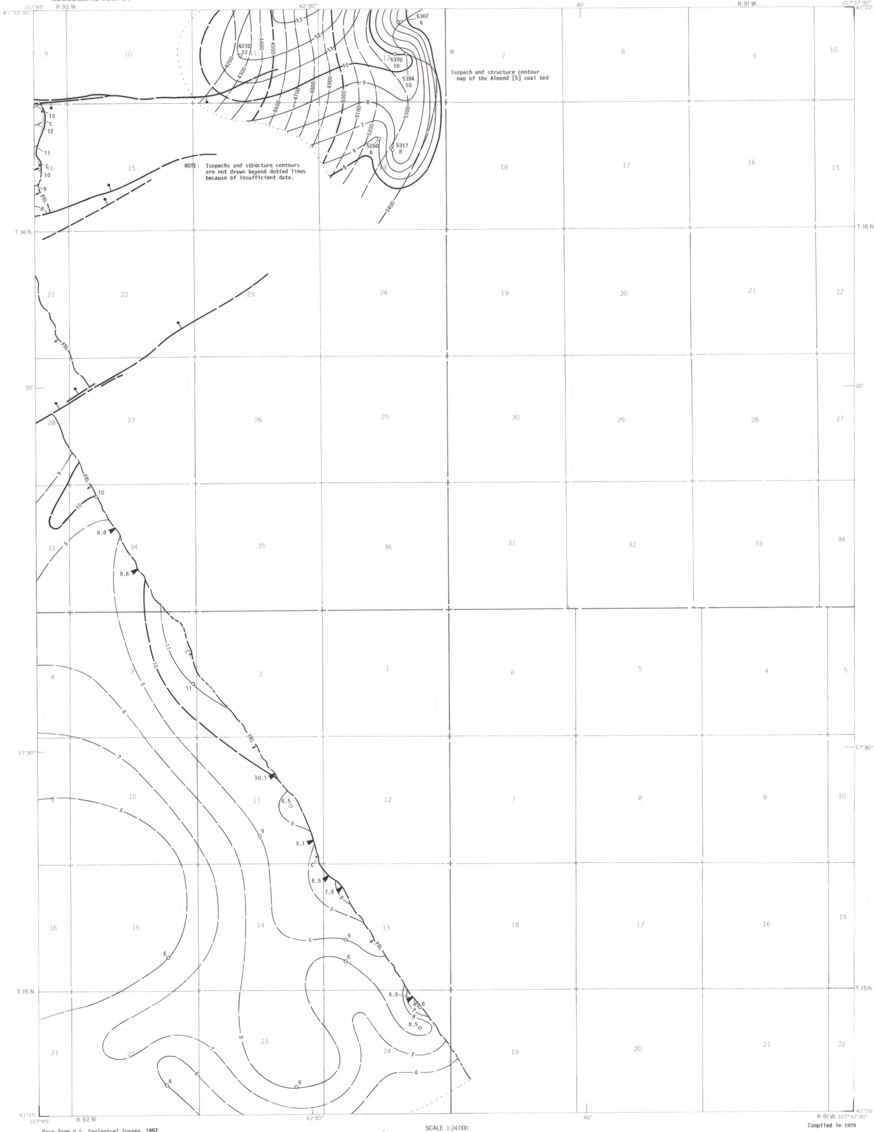
PLATE 16 OF 27

This report has not been edited for conformity with U.S. Geological Survey editorial standards or stratigraphic nomenclature.